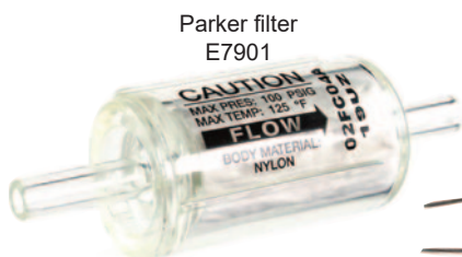
Parker filter E7901